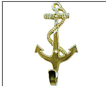
ANCHOR HOOK brass Length 120mm