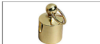
END PART, BRASS Brass polished With blocked screw