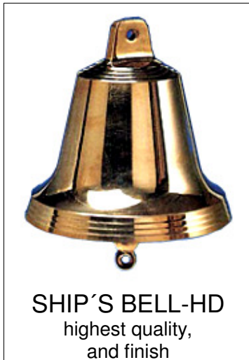
SHIP'S BELL-HD highest quality, and finish