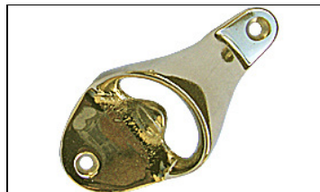
BOTTLE OPENER Brass polished