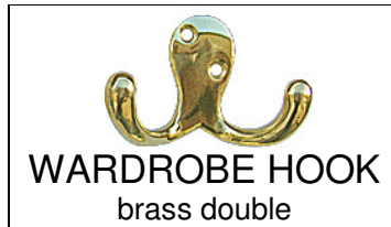
WARDROBE HOOK brass double