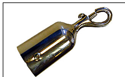
END PART, BRASS Brass polished With hook