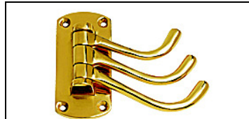
WARDROBE HOOK Brass pol. trippel 100x80mm