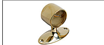
HAND RAIL, Brass polished. With blocked screw. Inside.diam. 38mm