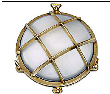
Bulkhead light round Brass polished 240v-E27