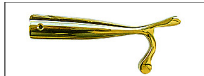
BOAT HOOK made of bronze or brass

Art.no. 220041 PCs / packaged 1 kit = 2-parts